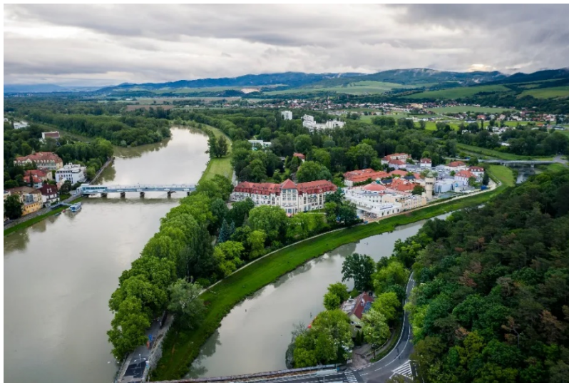
Piešťany panorama view