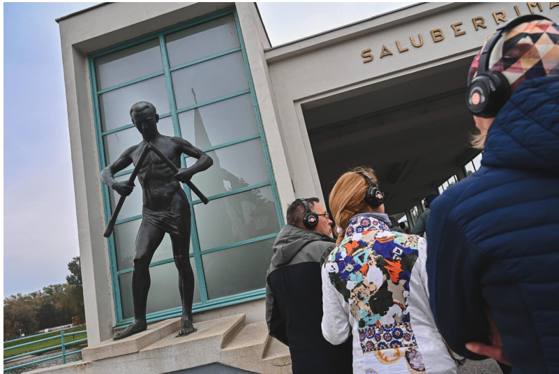
Piešťany spa symbol