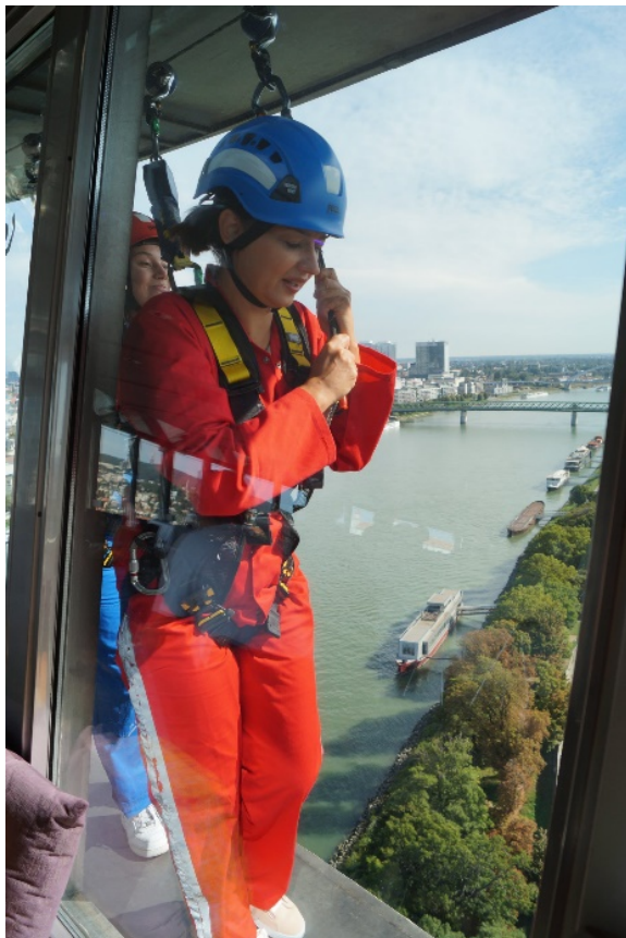
Bratislava UFO SKY WALK