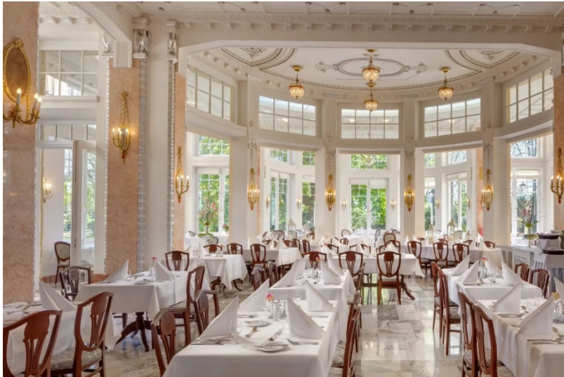
Piešťany Thermia Palace