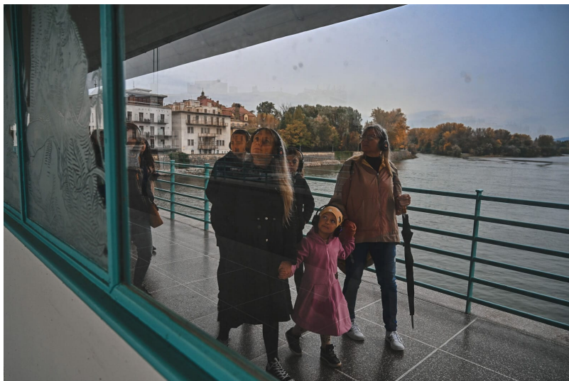
Piešťany the Colonnaded walking bridge