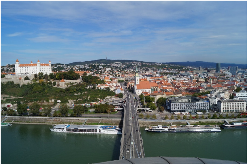
Bratislava panorama of left Danube river bank