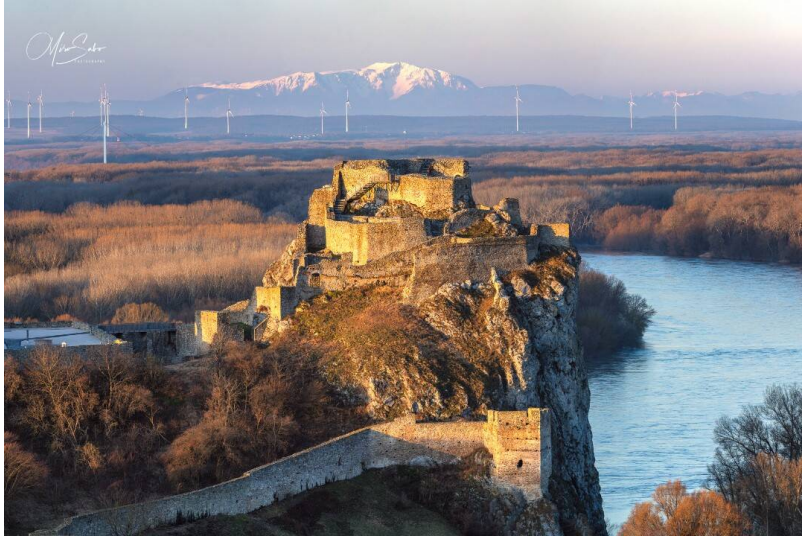
Bratislava castle Devín (view to Austrian Alps)