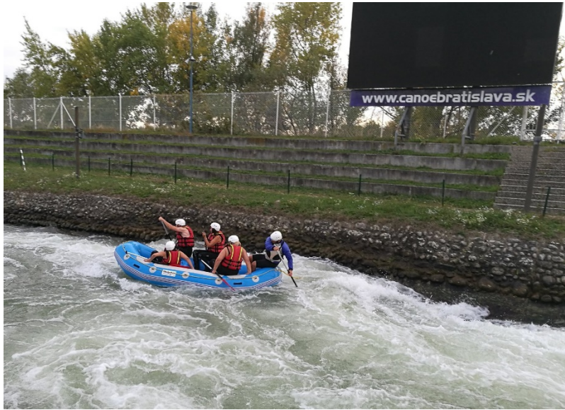
Bratislava Divoká voda - rafting