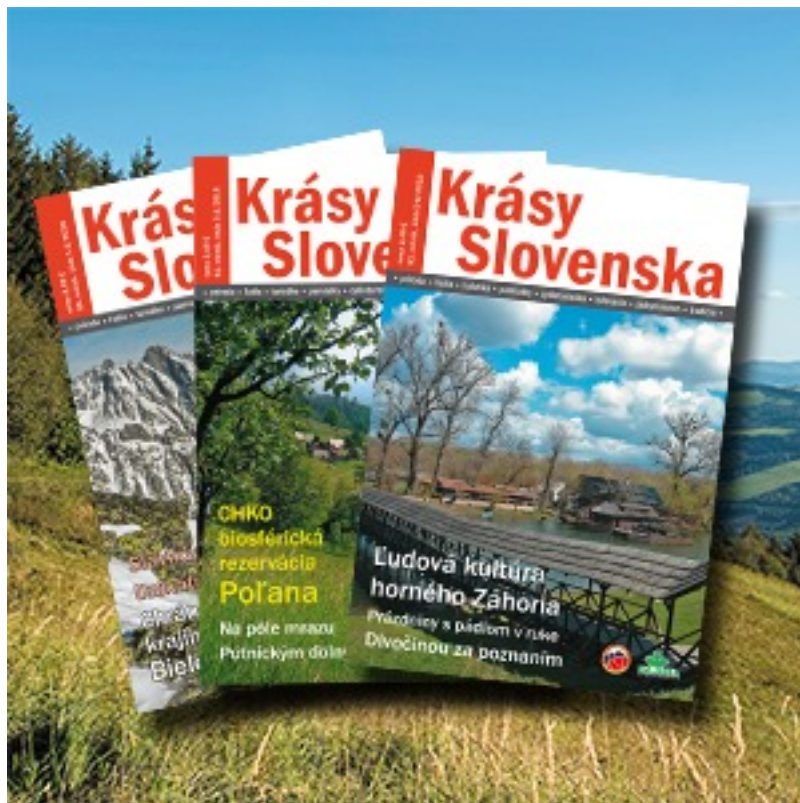
The oldest journal in Slovakia “Krásy Slovenska”