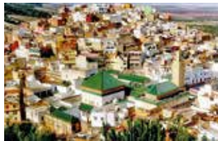
Moulay Idriss Zerhoun